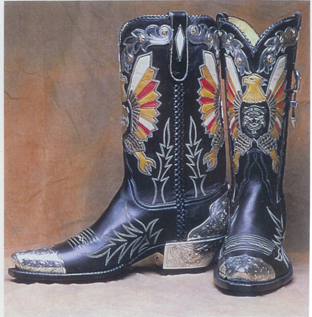
Honoring the American Eagle.