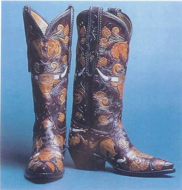
The Lori Jean Boot.