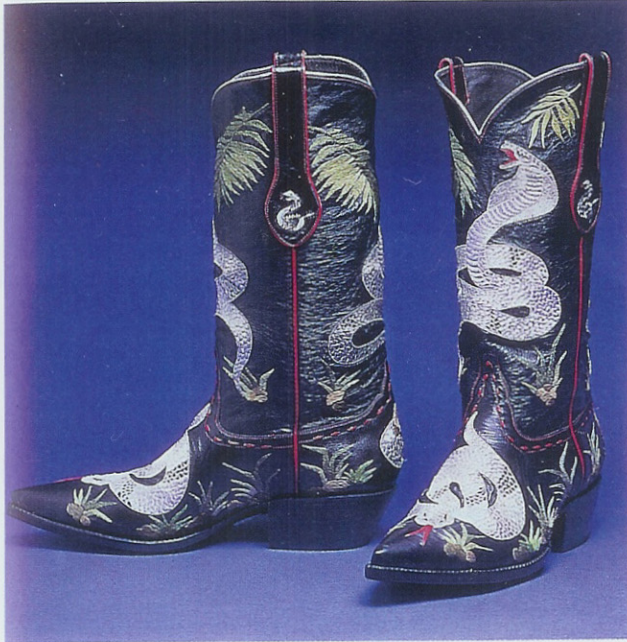
The Royal Silver Cobra.