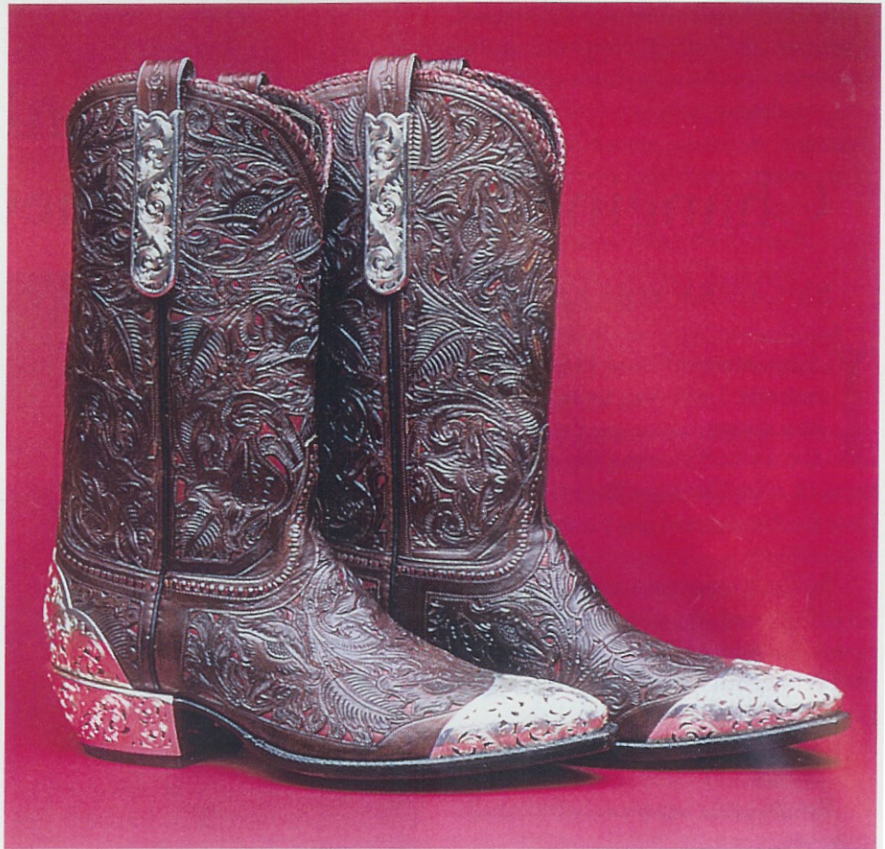
The Gene Autry Boot.