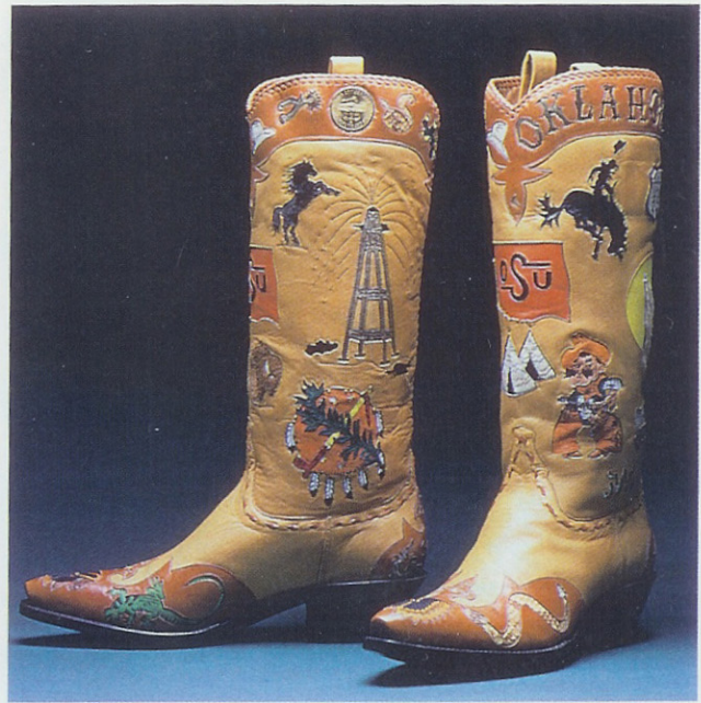
Oklahoma ~ Then and Now.